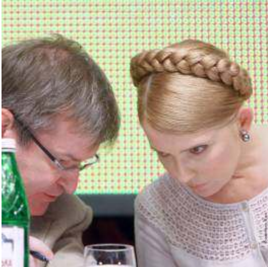
▲ Deputy Prime Minister Hryhoriy Nemyria (left) is responsible for Ukraine's integration into European structures.

Secondly, Ms Tymoshenko and her eponymous bloc (BYuT) approach NATO membership with a different strategy to President Yushchenko and the Our Ukraine-People's Self-Defence bloc. The Tymoshenko strategy is proving to be more successful in winning over Ukraine's integration.